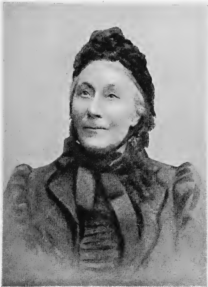
EMMA CONS, Founder of the Royal Victoria Hall, People's Palace for London, 1880.